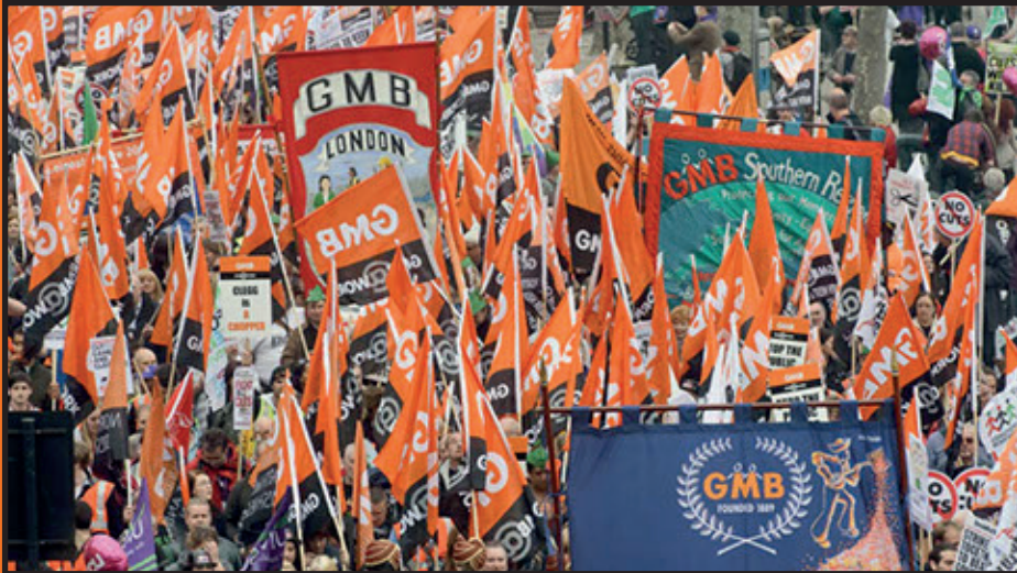
GMB Members out in force at a previous TUC Demonstration

The TUC have organised a demonstration for better pay and terms on all jobs in London on Saturday 12th May and GMB will be sending a massive delegation.