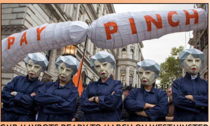
GMB MAYBOTS READY TO MARCH ON WESTMINSTER

"Public sector workers are being forced to go